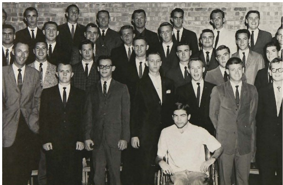
The Bengal Lancers in 1960